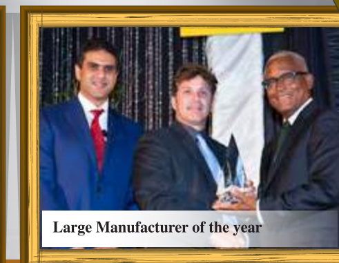
Large Manufacturer of the year