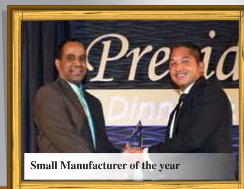
Small Manufacturer of the year