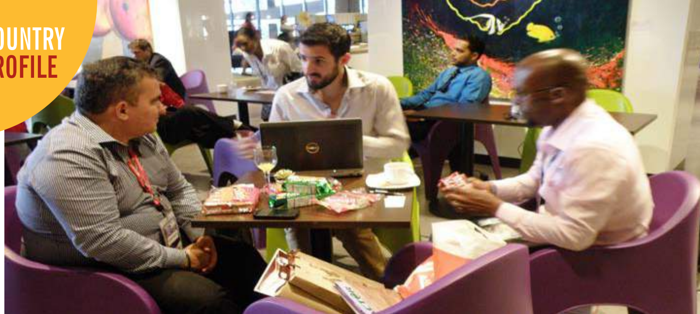
BERMUDEZ GROUP LIMITED MEETS WITH PANAMANIAN COMPANY, SI ES NATURAL