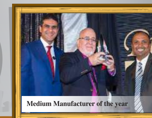
Medium Manufacturer of the year